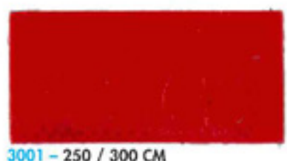
3001 - 250 / 300 CM