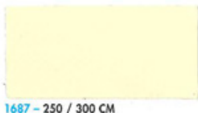
1687 - 250 / 300 CM