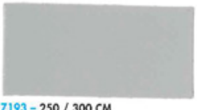
7193 - 250 / 300 CM