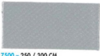
7500 - 250 / 300 CM