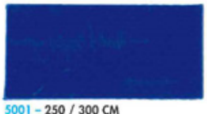
5001 - 250 / 300 CM