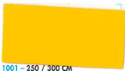
1001 - 250 / 300 CM

All our technical characteristics are indicative