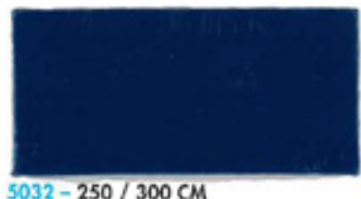
5032 - 250 / 300 CM