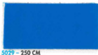
5029 - 250 CM