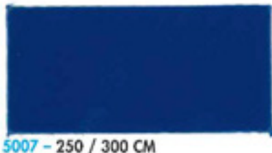
5007 - 250 / 300 CM