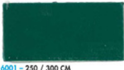
6001 - 250 / 300 CM