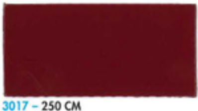
3017 - 250 CM